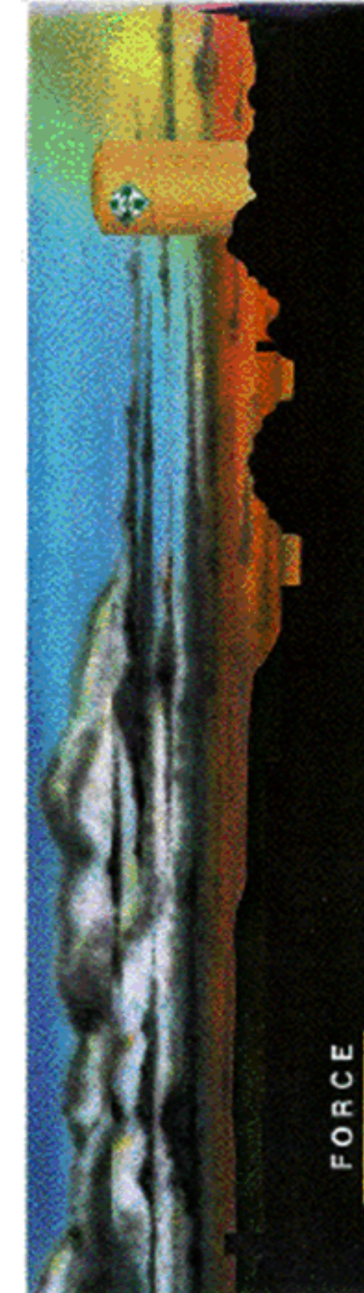
FORCE XXI - 4th ID

National Training Center, Ft Irwin, Ca. Edition Size: 1000 Print Size: 8"x 20" - Image Size: 4 3/8"x 18" Sunset, NTC - Central Corridor, looking West towards Tiefert Mt. and "Hidden Valley" Painted 1996