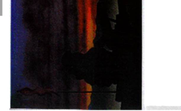
REPORT LINE - 11th ACR

4th Infantry Division - Ft. Hood, Texas Edition Size: 500 Print Size: 8"x 20" - Image Size: 4 3/8"x 18" Sunrise, Looking East towards 4th ID Water Tower from Division Headquarters Painted 1997