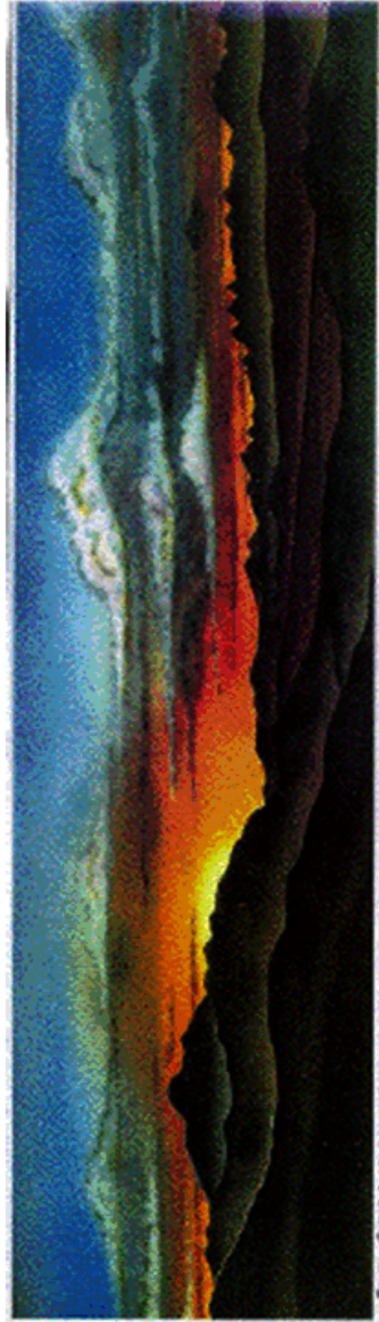
END OF MISSION

Shipping/Handling - $6.50 per Shipment 3 or more prints - $7.50 per Shipment